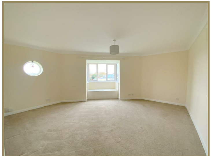
37 Kings Mews, Cleethorpes, North East Lincolnshire, DN35 0PG £97,500